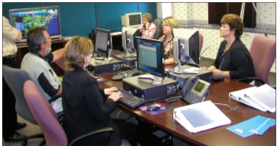
Members of communications company M/A-Com operate in their corporate EOC to facilitate and manage the company's response to restoring communications to the Gulf region after hurricanes devastated local emergency communication systems.

Eight of Hamilton's top 10 business employers have either direct or indirect input to this process, with three being